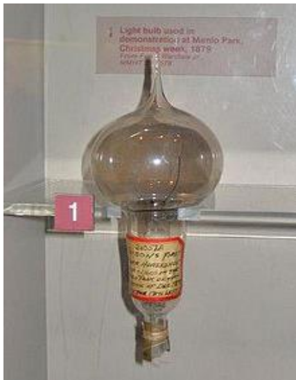
Thomas Edison's first successful light bulb model, used in public demonstration at Menlo Park, December 1879

Edison is highly influenced by the following famous quote by Sir Joshua Reynolds